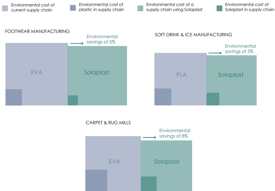
FIGURE 2: ENVIRONMENTAL BENEFIT IN END-MARKET SUPPLY CHAINS

Algix has had to overcome numerous challenges to get to the point where Solaplast is ready to scale up. The company is developing a new production site in China which will double its current capacity. Algix has also developed its own algae processing facility to ensure access to enough good quality feedstock.